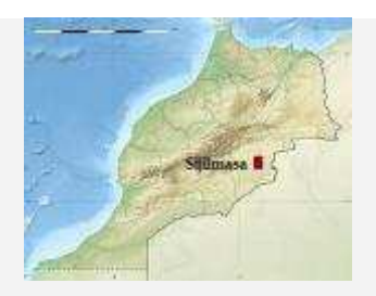
Sijilmasa in current day Morocco

Standing out in the heat of the desert, a group of conquering Berber tribesmen waited anxiously for their Imam to emerge from the city of Sijilmasa in North Africa. The year was 909 and they had successfully overthrown the Aghlabid rulers at Raqqada. Now was the moment they had longed for - they had come to retrieve their Imam from Sijilmasa, where he had been under arrest, and install him as their new Caliph. They dreamt and prayed that the world would finally achieve peace and justice under the rule of a divinely-guided descendant of the Prophet.