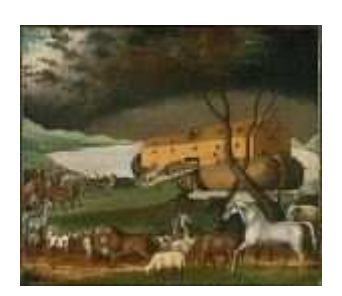
"The People of my Family are like Noah's Ark; Whoever boards the Ark is saved, Whoever stays away is carried off by the waves"....Hadith