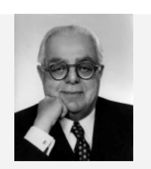
A portrait of the 48th Ismaili Imam.

"All men, rich and poor, must aid one another materially and personally. This fraternity is absolute, and it comprises men of all colours and all races: black, white, yellow, tawny; all are the sons of Adam in the flesh and all carry in them spark of the Divine Light. Everyone should strive his best to see that this spark be not extinguished but rather developed to that full Companionship-on-High.